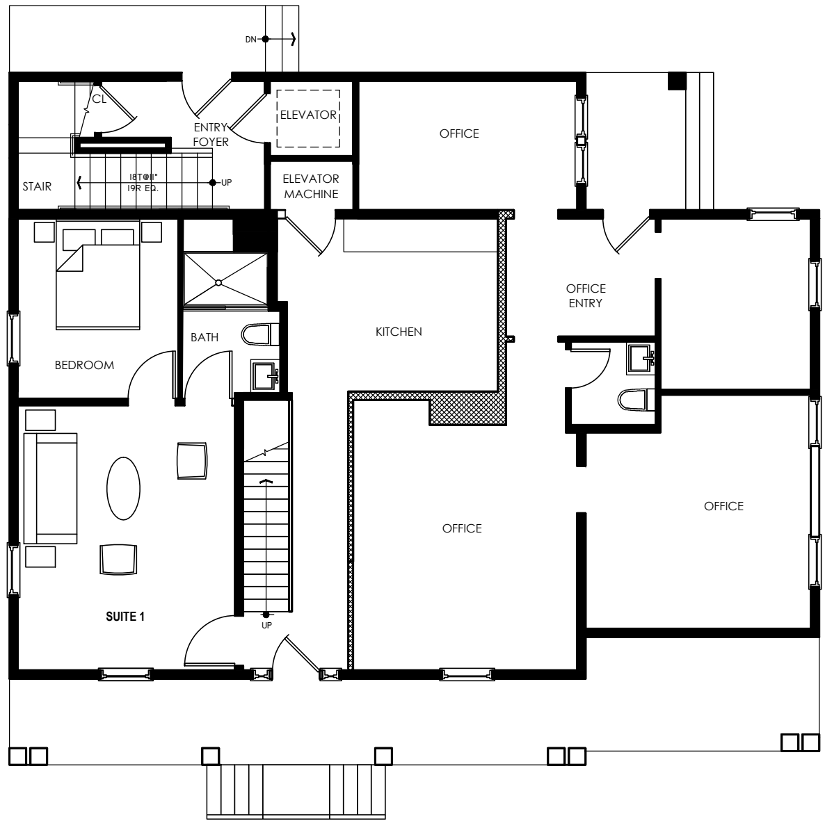
1 PROPOSED FIRST FLOOR PLAN SCALE: 1/8" = 1'-0"